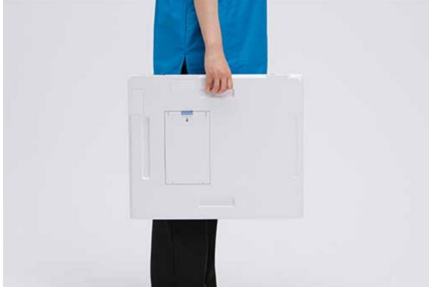
The CXDI-Pro sensor unit CXDI-703C Wireless