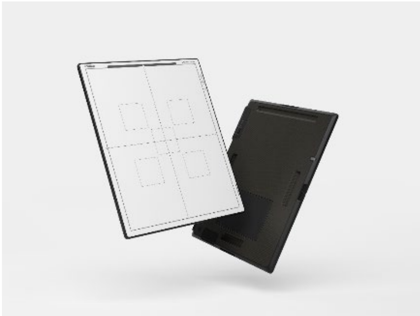
The CXDI-Elite sensor unit CXDI-720C Wireless

The CXDI-Elite series has high sensitivity, high image quality, and an ultra-lightweight, ergonomic design for ease of handling long battery life and AED 4 function. This makes the CXDI-Elite the ideal digital radiography detector for mobile applications or any general x-ray need. The unique functions, Intelligent NR and Built-in AEC 5 assistance expand the digital radiography possibilities.