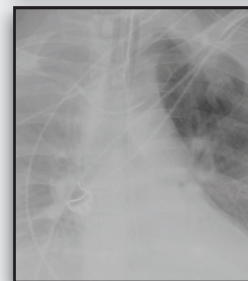
Imaging without Scatter Correction Feature