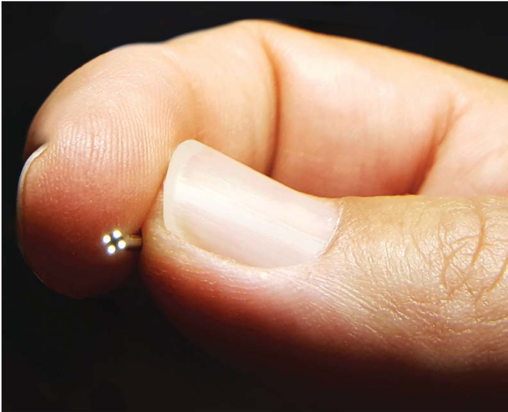
Figure 2. Toshiba Imaging's IK-CT2 is an ultra-small COT video camera system with a 0.7 x 0.7 mm back-side illuminated CMOS sensor featuring 220 x 220 pixel resolution. Shown with LED lighting option.

weigh its advantages if the target device is intended for single use. What will the application tolerate for a single-use expense, based on procedure reimbursement rates? Alternatively, if the device cost and design quality allows for its re-use for some number of cycles, what return-on-investment (ROI) calculations are needed to support this approach? If a product will be subjected to multiple sterilization cycles, then additional validation may be required to determine if sterilization is not only effective, but that the product design is rugged enough to successfully clear the given number of re-use cycles.