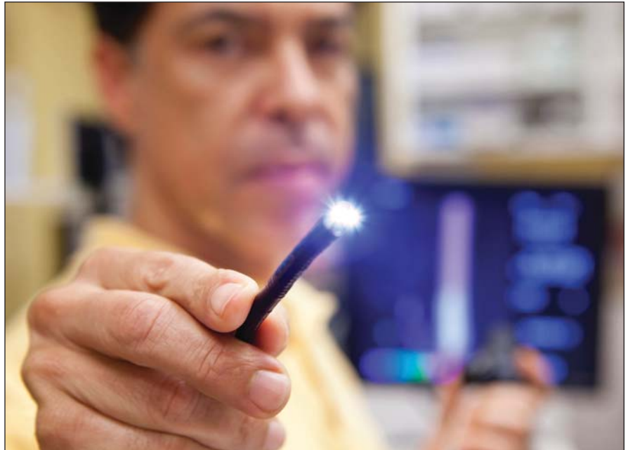
Figure 1. A doctor holds a lit probe used in endoscopic procedures.

You are on a QUEST — an acronym for Quality, Use, External, Supplier, Technology. Through these five steps, you can define your specific device requirements and select the best technology and supplier for your application. The relative importance for each component will be driven by your application, so the list is not a step-by-step progression as much as it is a reminder of the core elements to consider.