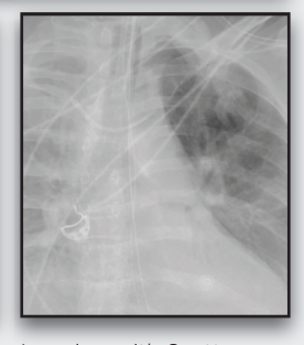
Imaging with Scatter Correction Feature and without grid